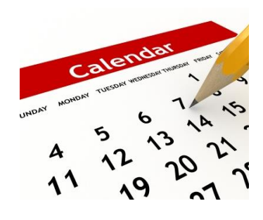
April 8 - 12 Spring Break !!

All ads are subject to the approval of the LWEA Executive Committee and may be edited for length.